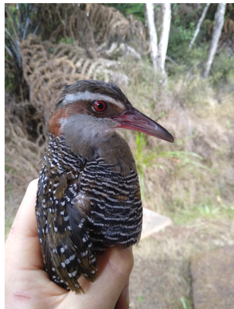
Adult Banded Rail (moho pereru)