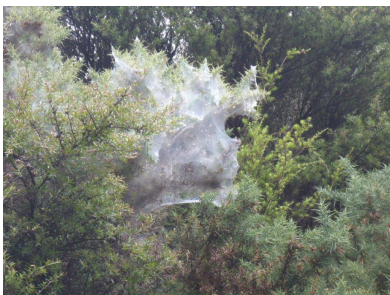
Gorse mite web