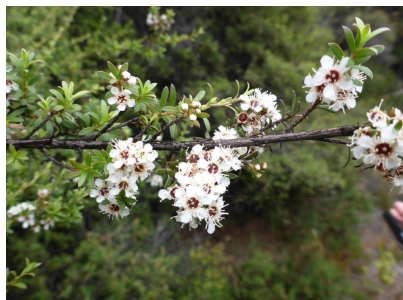
Manuka in flower