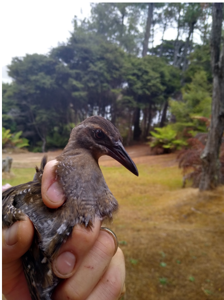
Juvenile Banded Rail (duller)